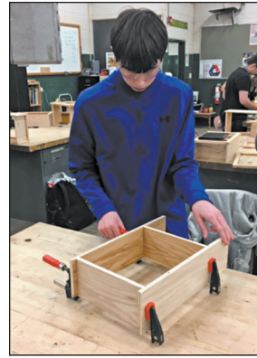
Through a partnership with the Home Builders Association, students gain real world experience in the construction pathway.